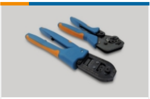
Hand Crimping Tools(2)